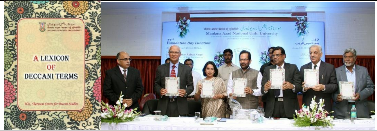
Release of the research study titled A Lexicon of Deccani Terms