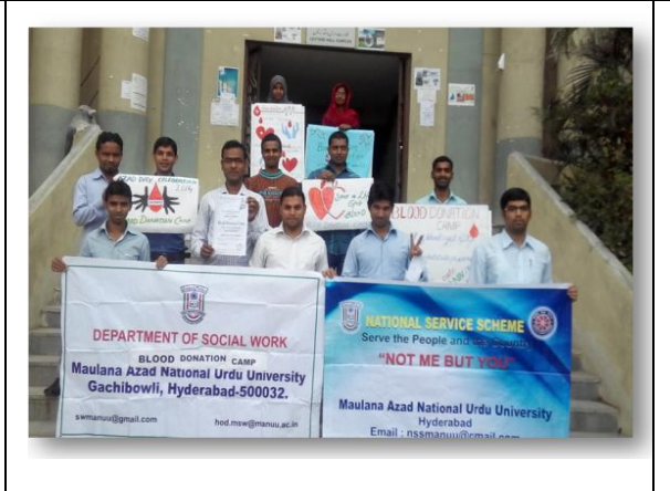
Blood Donation Campaign @ MANUU Campus