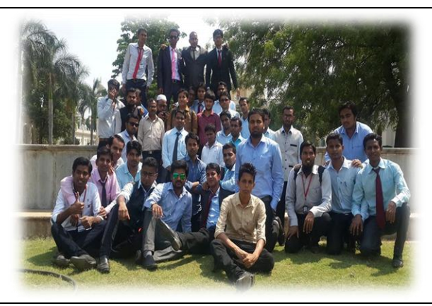
Industrial Visit MBA II Semester to Parle Food Company