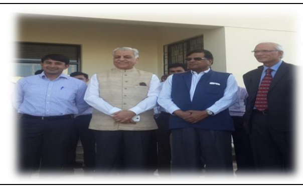
Snnap-shots of International Student Day celebration: Department of Comp. Science & IT Building: