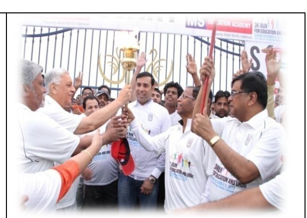
MANUU - 3K RUN for Education & Urdu