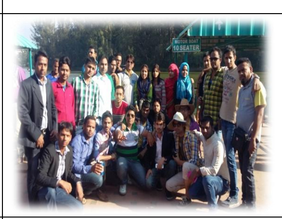
Industrial Visit MBA IV Semester

TWO- DAY INTERNATIONAL CONFERENCE (17TH -18TH MARCH 2015) BY DEPT. OF MCJ THEME: MUSLIMS, DEMOCRACY AND THE MEDIA: CHALLENGES AND PROSPECTS