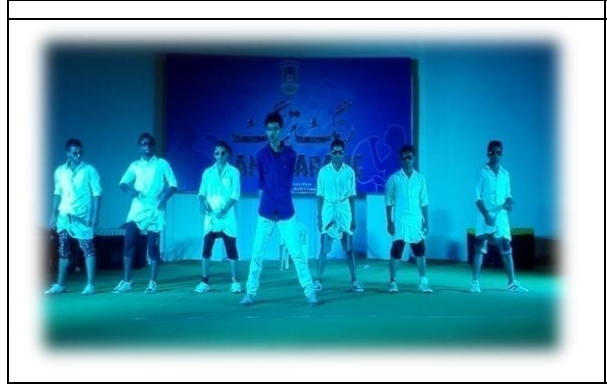
Four students of MA (English) performed group dance in Rang Tarang on 7th November 2014