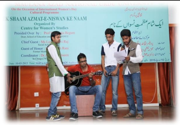
Cultural Programme "Ek Shaam Azmat-E-Niswan ke Naam" on International Women's Day -2015