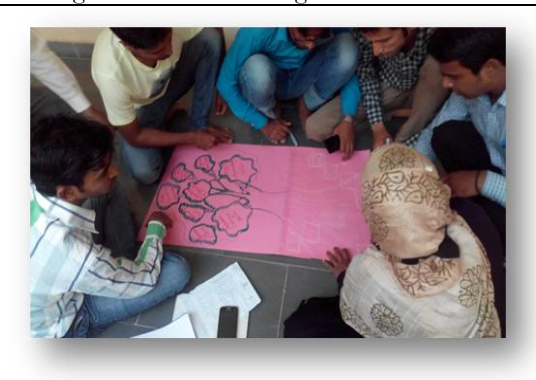
Skill Lab Exercise @ Dept. of Social Work