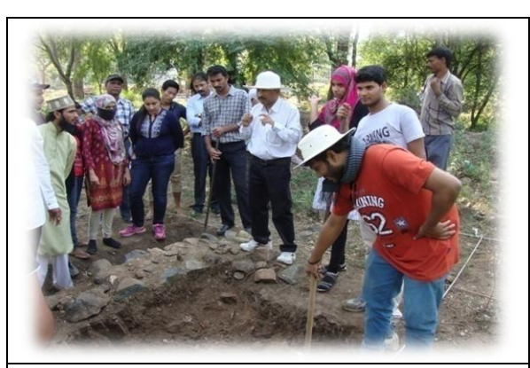
Students at the Archaeology Workshop