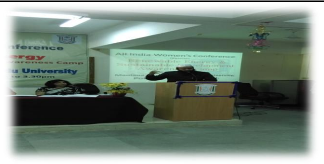
"Renewable Energy & Sustainable Development" Program on 10th Feb, 2015 at MANUU Polytechnic by AIWC & MANUU