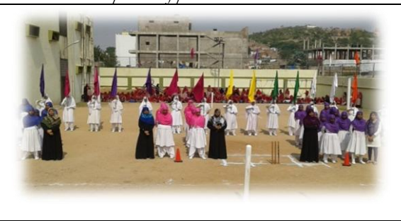
Oath Taking by MANUU MODEL School students